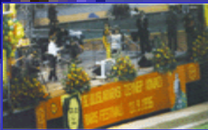
Recruitment and training