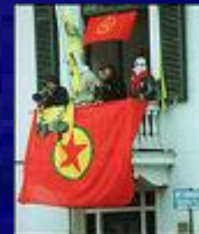
Violent attacks against Turkish targets